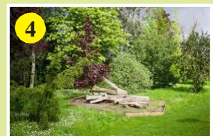
Site 4: Old Botanic Garden, Poolle Gate