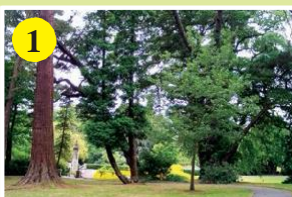
Site 1: Reed Hall Arboretum and listed historical landscape