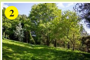
Site 2: Birks Bank Arboretum