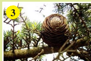
Site 3: Edinburgh Wild Conifer Collection